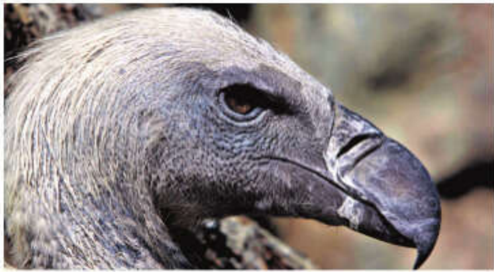
Cape vulture in its enclosure at the Vulture Programme at Boekenhoutkloof near Hartbeespoort Dam, South Africa on Sept