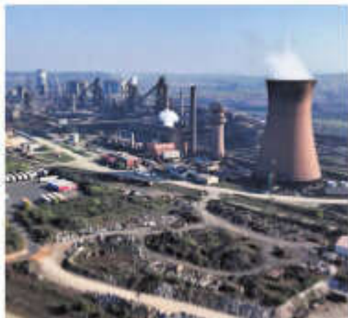
Screen grab from PA video shows a view of the British Steel plant in Scunthorpe, Lincolnshire

LR: Light Rain • HR: Heavy Rain • LS: Light Snow • TDS: Thunderstorm • LC: Light Cloud • SNY: Sunny