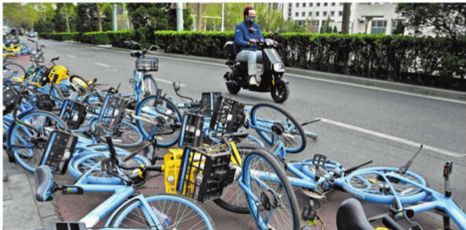
A man rides past bicycles which were blown over by strong winds in Beijing on Saturday. Strong winds wreaked havoc in Beijing and parts of northern China, causing hundreds of flights to be cancelled, public attractions to shut and rail lines to be suspended, state media said