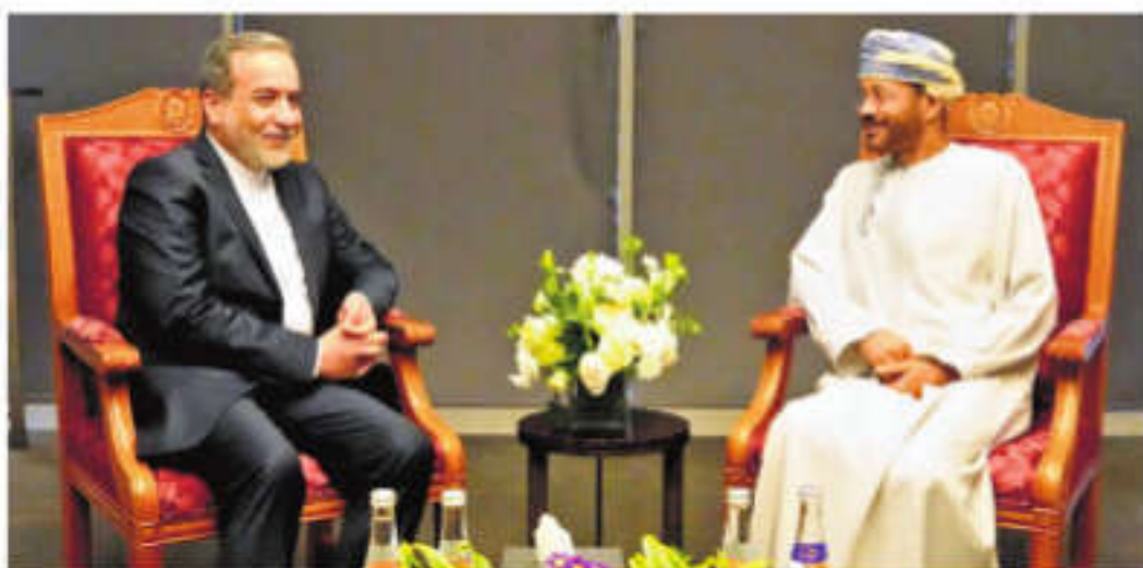
Handout picture provided by the Iranian Ministry of Foreign Affairs shows Iran's Foreign Minister Abbas Araghchi (L) meeting with Oman's Foreign Minister Sayyid Badr al-Busaidi in Muscat on Saturday

"At today's meeting, I think we came very close to a basis for negotiation... Neither we nor the other party want fruitless negotiations, discussions for discussions' sake, time wasting or talks that drag on for ever," he added. Oman's foreign minister acted as intermediary in the talks in Muscat, Iran said. The Americans had called for the meetings to be