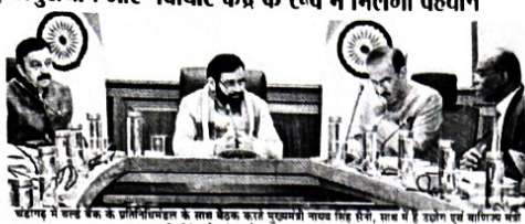
हरियाणा में एआई अनुसंधान और नवाचार केंद्र के रूप में पहचान मिलेगी