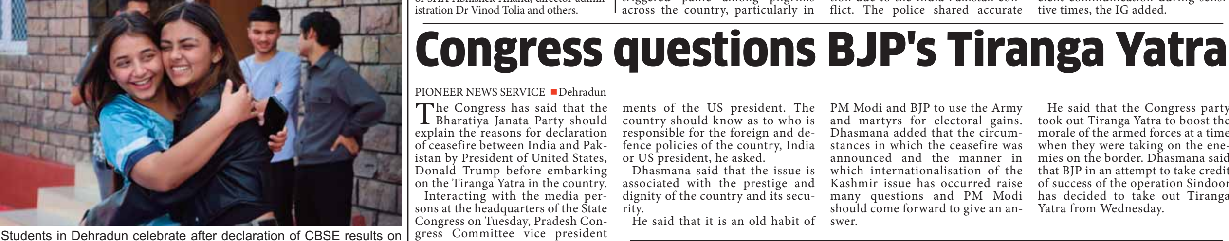
Students in Dehradun celebrate after declaration of CBSE results on Tuesday

trains, buses and helicopter services for the pilgrimage and were concerned about potential cancellations. In response, the police set up a dedicated WhatsApp group to communi-cate directly with the affected pilgrims. Many were also questioning whether the government had halted the Char Dham Yatra and its registration due to the India Pakistan conflict. The police shared accurate